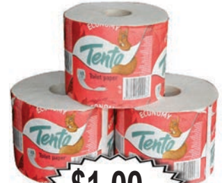
Tento Toilet Tissue