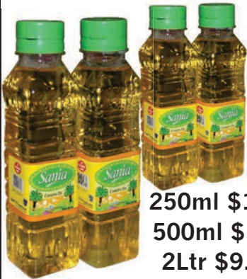
Sania Cooking Oil