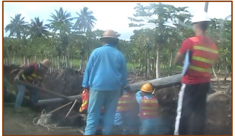
Removal of pipe from private land