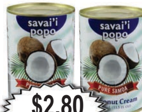
Savai'i Coconut Cream