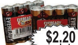
Eveready Batteries AA Size (pack of four)