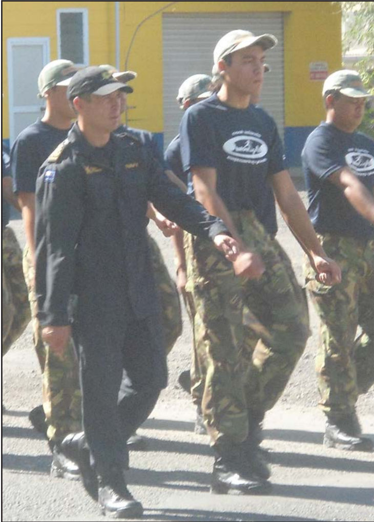
Leadership Trainees graduation last Friday.