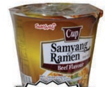
Samyang Ramen Beef Flavour