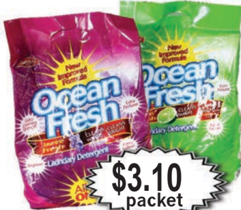
Ocean Fresh Laundry Powder 1kg Jasmine or Lemon scented