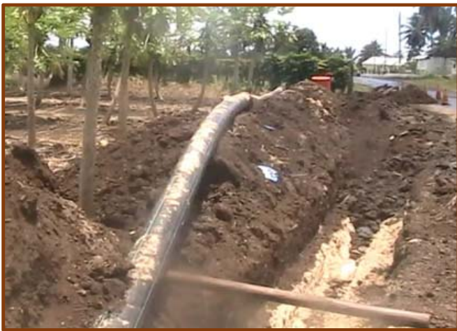
Trespass on Landowner Property