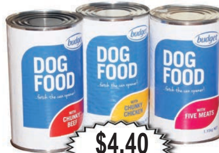
Budget Dog Food