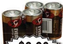
Eveready Batteries D Size (pack of two)