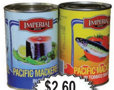
Imperial Mackerel in Oil or Tomato Sauce