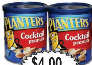
Planters Cocktail Peanuts