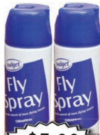
Budget Fly Spray