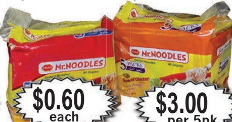
Mr Noodles 5pack Special Chicken & Curry Chicken