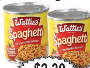
Wattie's Spaghetti 220g