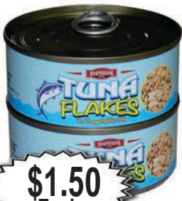
Imperial Tuna Flakes